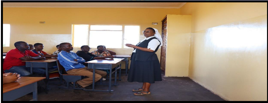
Learners Familiarise with the School